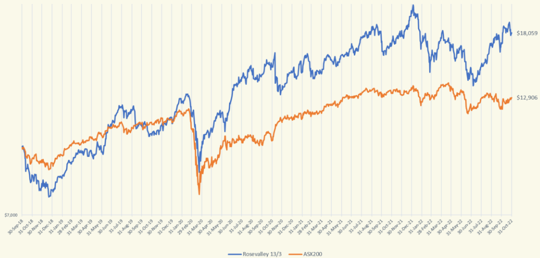
Rosevalley 13/3 Since inception Growth of $10,000

Note Rosevalley numbers are not audited